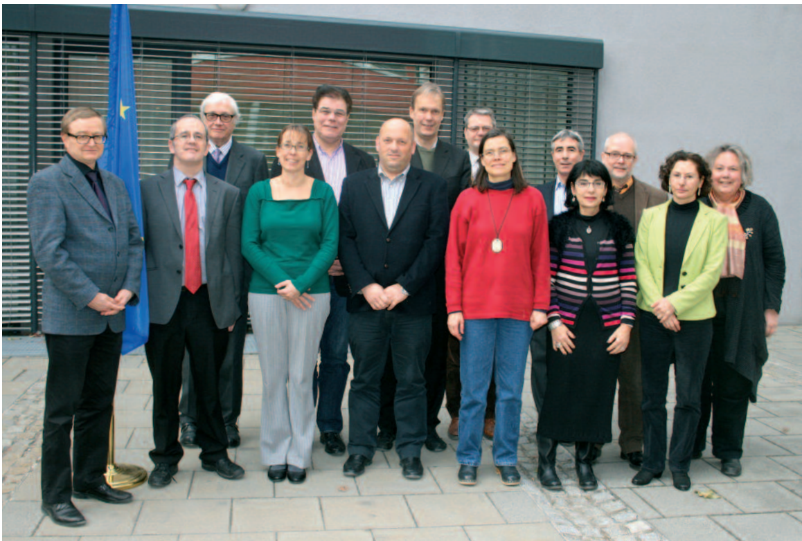
Representatives of the Professional Network Forum (from left to right)

The INGO Professional Network Forum ( http://www.ecml.at/professionalnetworkforum ) is formed of international associations and institutions that share common values and