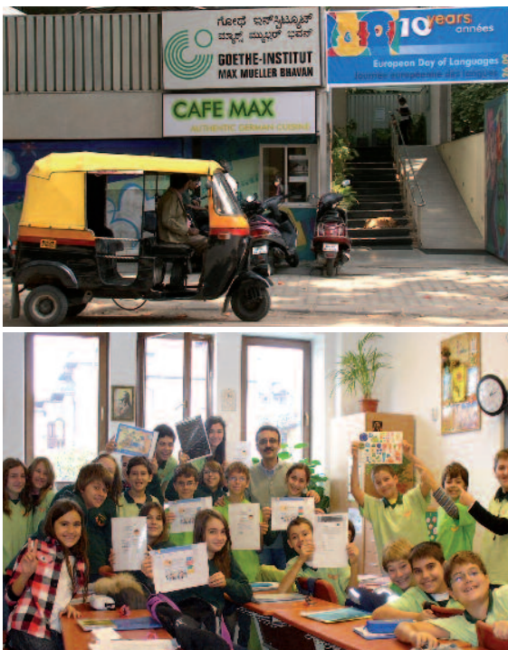
EDL celebrated around the world

The Day differs from the Centre's other activities in that it is not focused on a specialist target public but encompasses everyone interested in languages. With activities often organised as large-scale events in city and town centres around the continent as well as in schools,