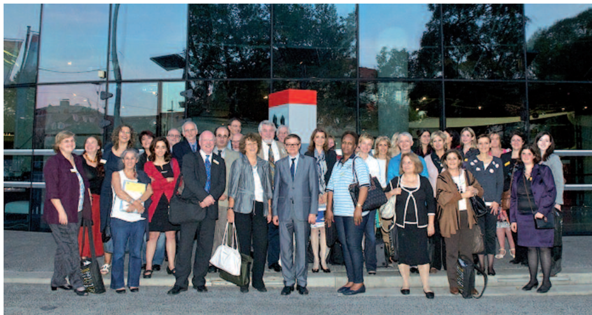
ECML conference participants in front of the Kunsthaus, Graz

The Association has also invited all institutions in Graz involved in the field of languages to come together in the Sprachennetzwerk Graz (the Graz Language Network). This provides a platform for building up and strengthening synergies and exchange of information. Beyond the general objective of promoting plurilingualism, the Network aims to make the competences of the institutions based in Graz more visible both nationally and at European level and to underline the city's specificity as a place of language-related expertise.