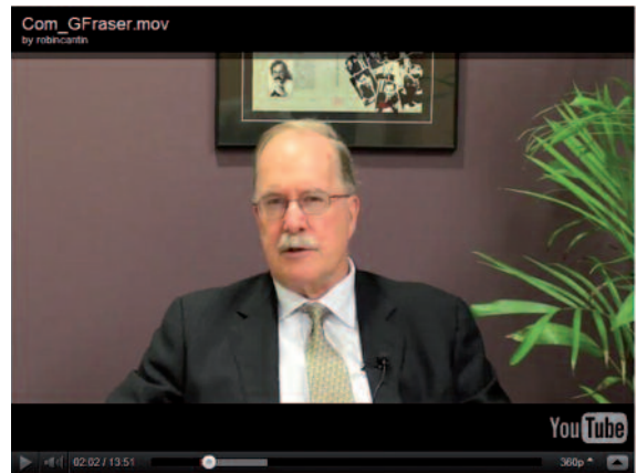
Graham Fraser, Canadian Commissioner of Official Languages - video message to the ECML conference

The INGO Forum represents a major pillar of cooperation for the ECML and has attracted a new clientele to the work of the Centre. In 2011 it provided an effective channel for dissemination in the Centre's Call for submissions and also for the results of the Empowering language professionals programme. At its meeting in February 2012 the partners focused on ways of maximising the potential of access to their combined network of hundreds of thousands of language education practitioners.